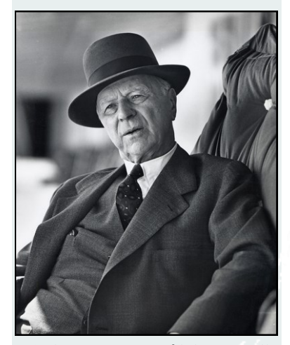
"The Great Wildcatter"

The MLBC membership application is located on the website at <u>www.mlbc-aapl.org</u>. Please check your information on the website prior to submitting your renewal. The MLBC website has an updated version of the membership listing. Please use this resource if you can not find yours or others information in the directory. Please report any errors or omissions to Tara White at <u>twhite@mlbc-aapl.org</u>.