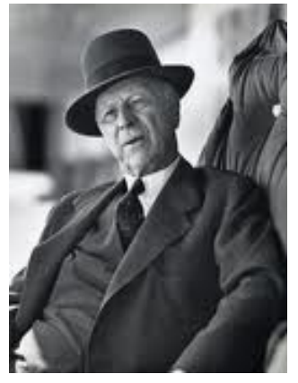
"The Great Wildcatter"