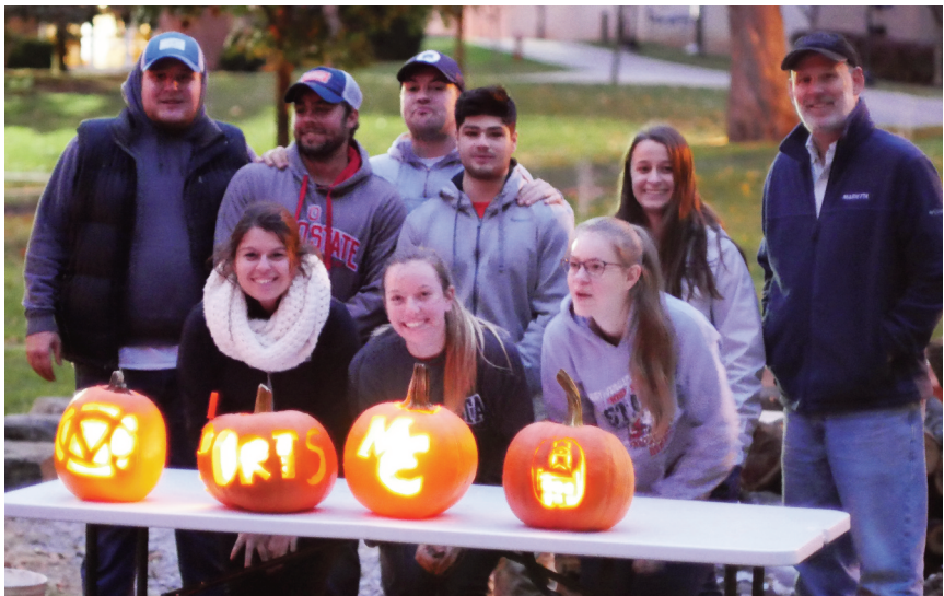
1st Annual B&E Department Pumpkin Carving Competition - Competitors and Judges