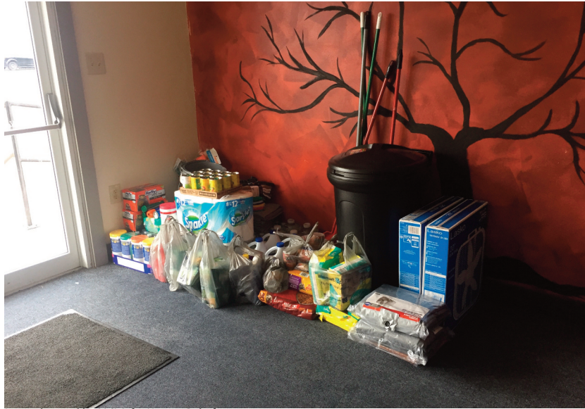
Items donated by MCLA for Harvey Relief

After hearing about the devastation caused by hurricane Harvey, MCLA, like AAPL, was eager to help those in Texas. Students gathered several items, including canned food, cleaning supplies, and other needed materials. These items were then delivered to Lynn Street Church of Christ in Parkersburg, WV. From there volunteers took the items to El Campo, Texas where they were dispersed to victims.