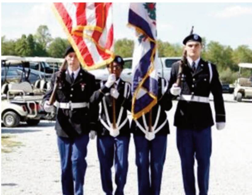
The MLBC of AAPL raised over $22,000 for West Virginia Veterans. See PG. 10