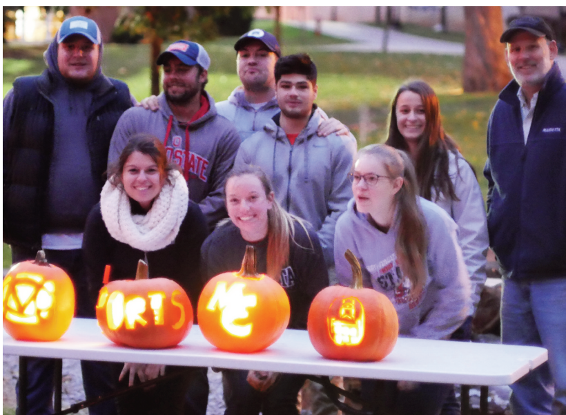
Marietta College's Land & Energy Management program graduated 10 individuals under their accredited program and the first class of graduates participated in various activities throughout the year. See PG. 12