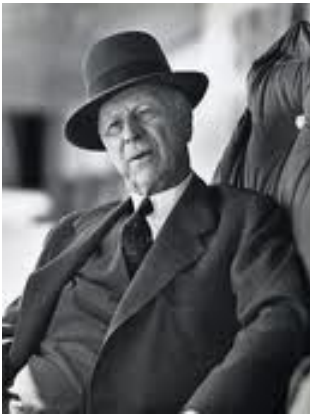
“The Great Wildcatter”