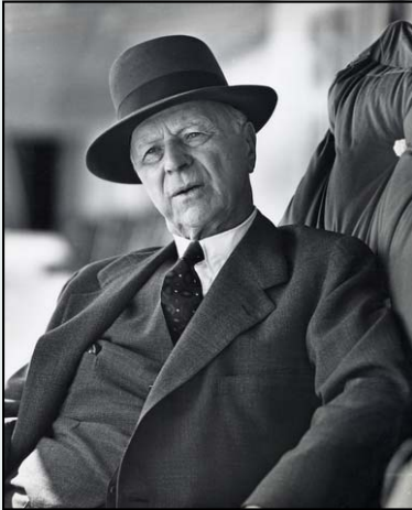
“The Great Wildcatter”